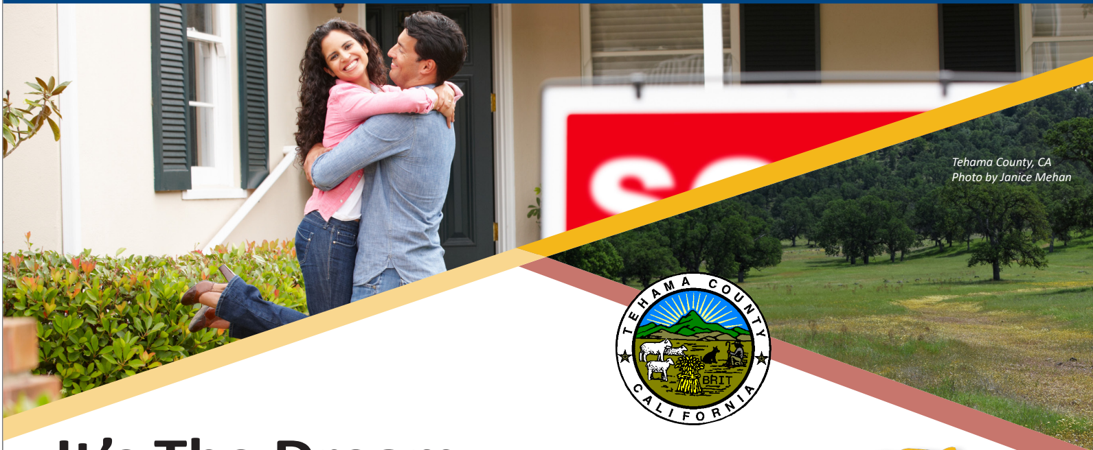
Tehama County, CA